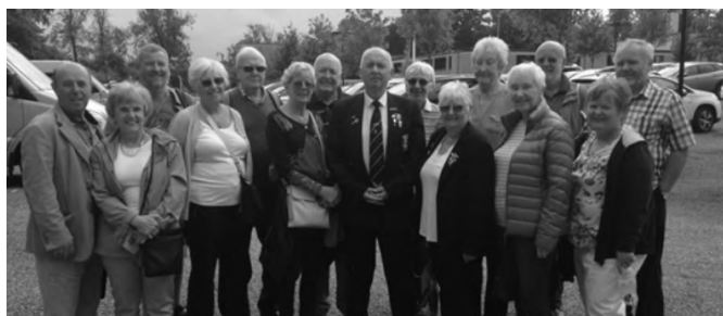
Group Photo in car park

A group of twelve members and three friends benefited from excellent weather while gaining an insight into the lives and work of Alan Turing's specialists who unravelled the Lorenz and Enigma codes, effectively shortening the length of World War 2 by up to two years.