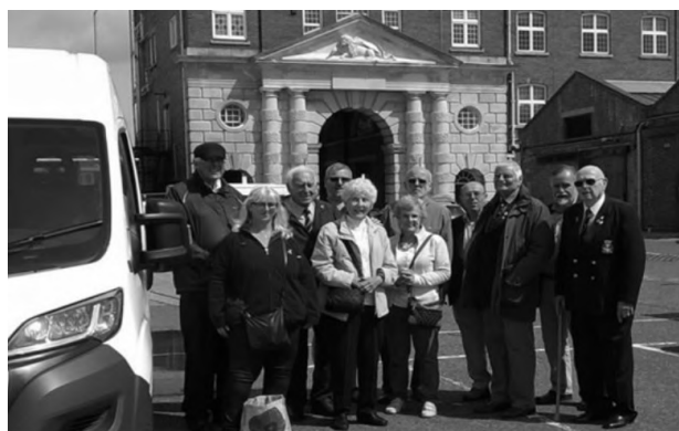
Group photo in front of Semaphore Tower (with new RNA Bus)

second visit was needed as there was just too much information to absorb in one go."