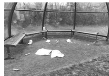
Littering at Foxley Fields Shelter

01344 454602 | binfieldparish.council@btinternet.com | www.binfieldparishcouncil.org.uk