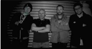
DADS R LOUD