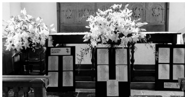
Beautiful Easter Lilies at All Saints' Church