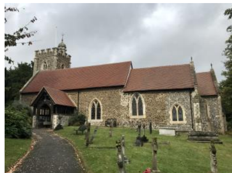
All Saints' Church

Walk down Terrace Road North, passing the Jack O' Newbury, until you come to a road (Wicks Green) on your right. Follow this road, past a set of Almshouses, until you come to the gate back into the park. Follow the gravel path back to the car park.