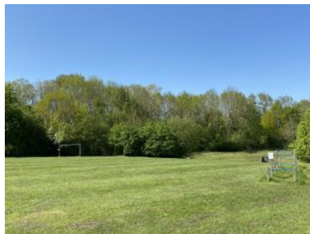
Wicks Green Park

Turn right at the T-junction opposite the cemetery gate to reach the main road. Follow this in the same direction, crossing it when a footpath appears on the far side, and then turn left along Forest Road North, but not before looking back at All Saints Church. If you have time, the church and its graveyard are worth exploring. Parts of the church date from the 14th Century.