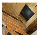
Fig.34: Pier 1 - Small space behind failed area of plaster