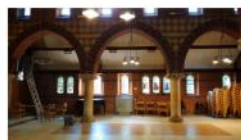
Fig.32: South Aisle (internal view)