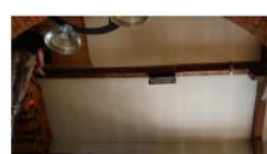
Fig.36: Pier 1, 5.5 ft - 6 inches evident throughout