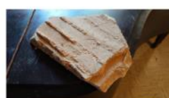
Fig.35: Failed plaster