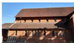
Fig.31: South Aisle (external view)