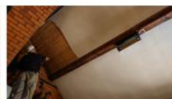
Fig.33: Pier 1 - Area of failed plaster