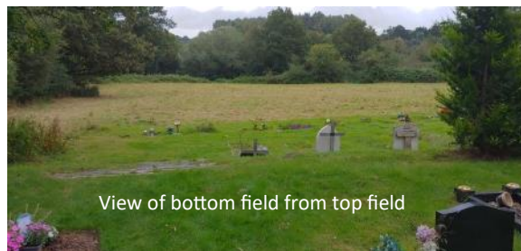
View of bottom field from top field