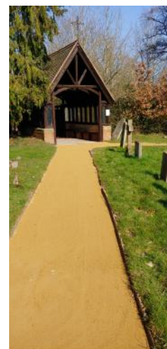
Top path and gate before and after