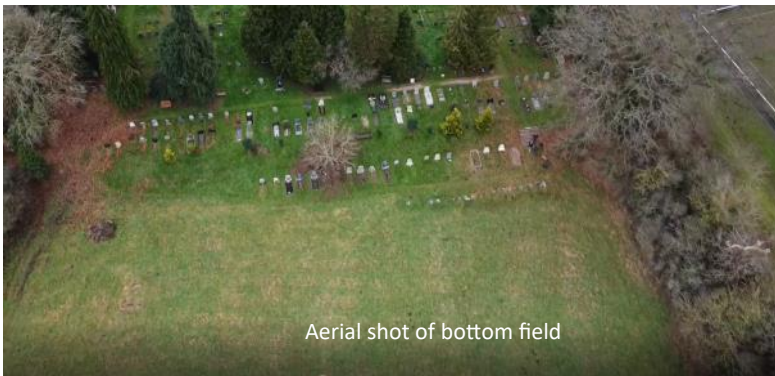
Aerial shot of bottom field