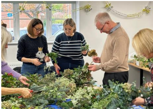
DRL Christmas Party