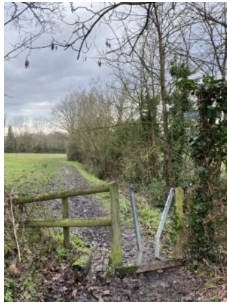
Path entrance opposite cottages

On the north side of the car park (right side as you drove in) take the gravelled path past an information board and around the edge of the park to the north-west corner. Pass through a small gate and turn right along Wicks Green. Pass Wicks Green Cottages (a Grade II listed building originally built in the 16th century). Take the footpath on the left, into the field opposite the cottages, and follow the right-hand field edge almost reversing your previous direction.