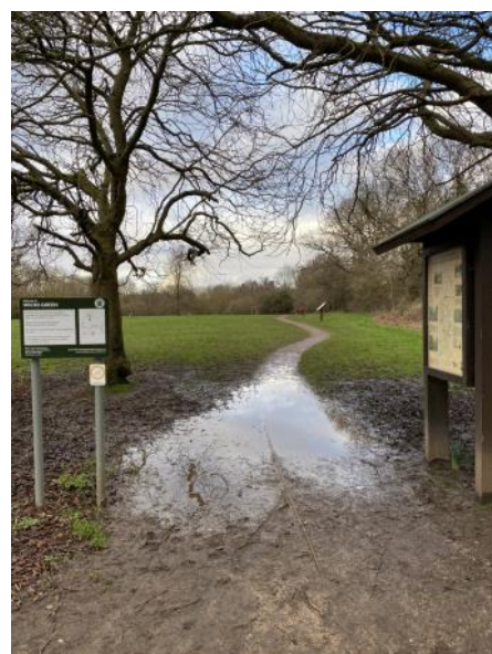
Park entrance from the Car Park off Stevenson Drive