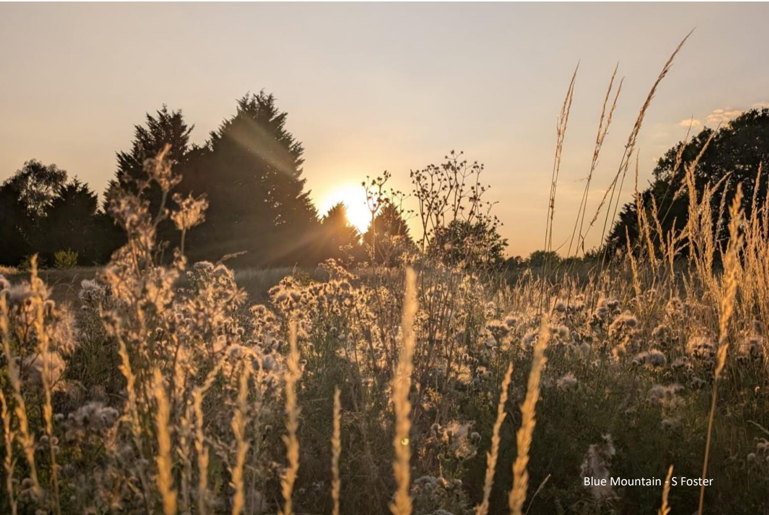
Blue Mountain - S Foster